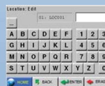
Alphanumeric Location Labels