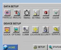
User Friendly Configuration